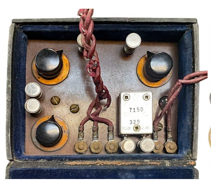
Transmitter top view showing controls and connections.

- Photographs and information courtesy Reinhard, Germany.