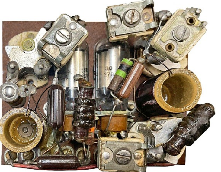
Bottom view of transmitter.

© This WftW Volume 4 Supplement is a download from www.wftw.nl. It may be freely copied and distributed, but only in the current form.